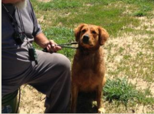
Look Up Tuck!